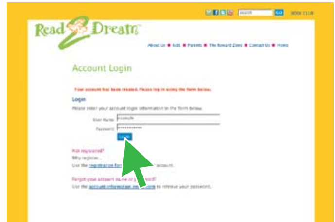
4. Registration is complete. Use the name and password you just created to login. (If you forget them, use the link provided. Make sure to use the login — not the registration form.)