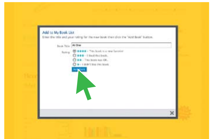
6. Add a book or chapter title. Rate and click Add Book. Check the book shelf on your account page!

Download additional copies of this instruction sheet at www.read2dream.com/tools.cfm