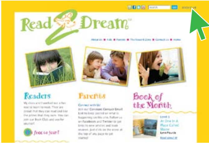
1. Go to the site: read2dream.com