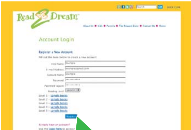
3. Fill in registration. No last names or identifying information is required. Sample book titles are provided to help select a reading level. You can use the same email for all your children's accounts.